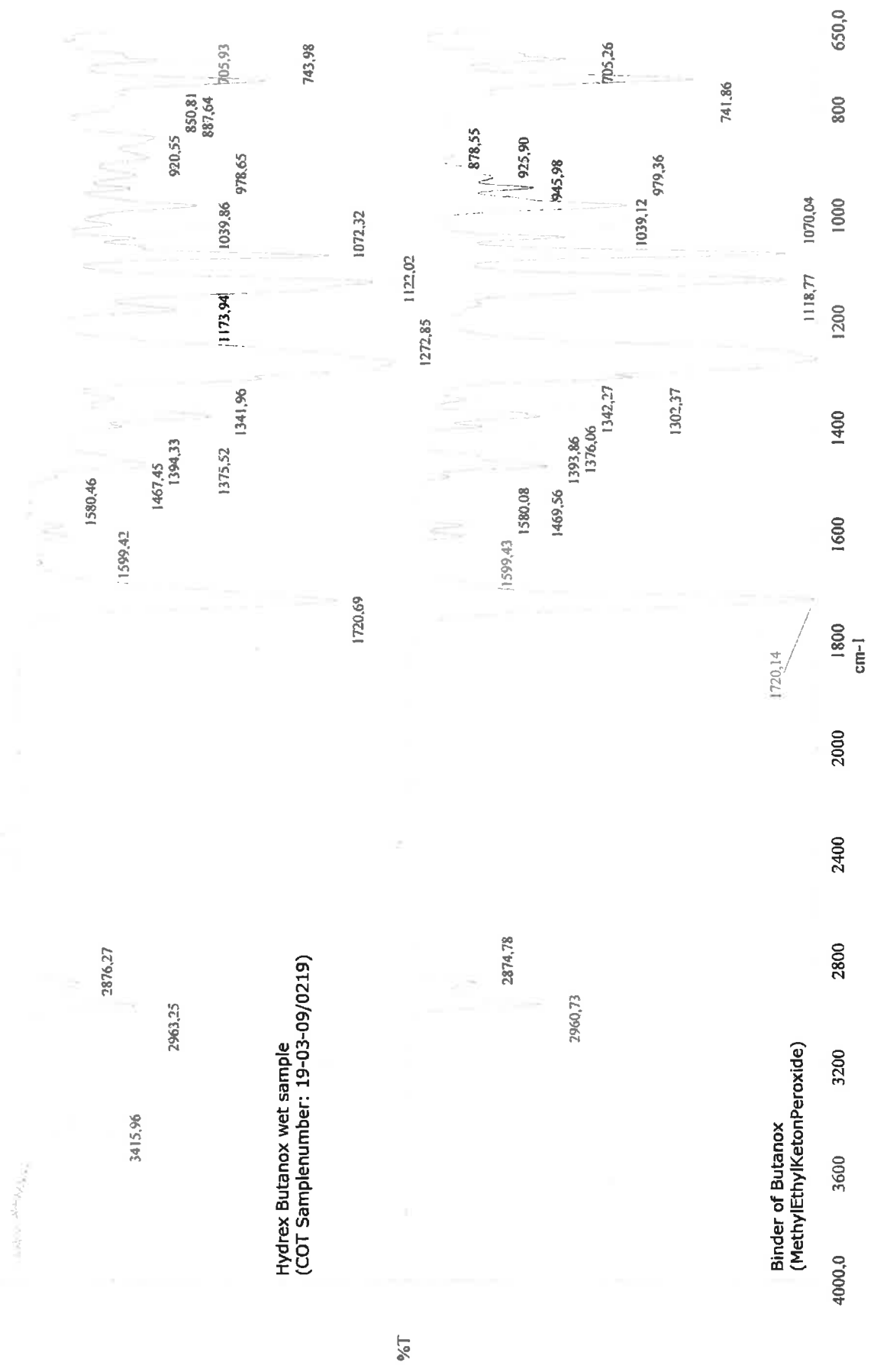
Hydrex Butanox wet sample (COT Samplenumber: 19-03-09/0219)