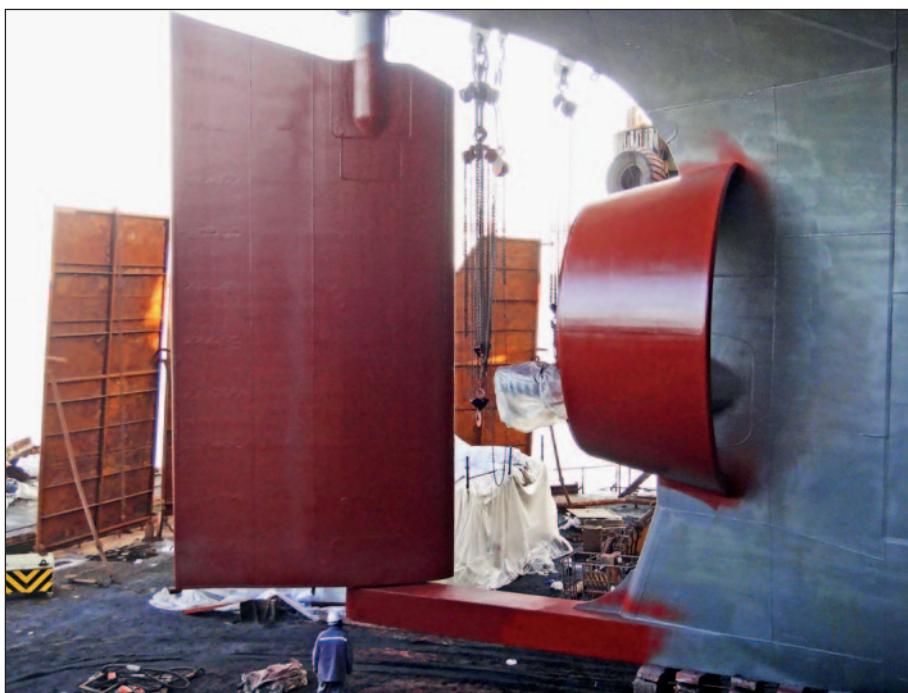
Rudder and nozzle of the Pleiades ship Xanthos with freshly applied Ecospeed. Pleiades Shipping Agents S.A. are a long term repeat customer of Subsea Industries and Bogdanos.

“The recent sale was a direct result of an email campaign we ran in November of 2023,” explains